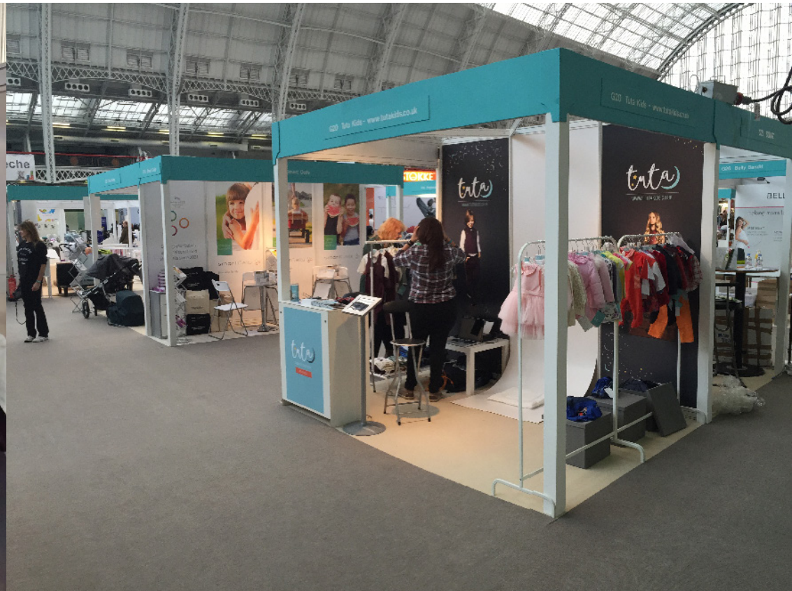
Stands for The Baby Show and Bubble 2016.